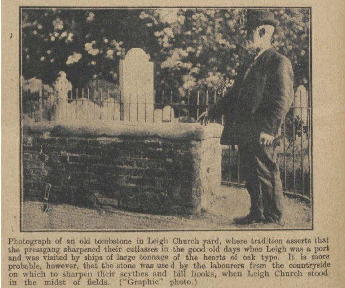
Photograph of an old tombstone in Leigh Church yard, where tradition asserts that the pressgang sharpened their cutlasses in the good old days when Leigh was a port and was visited by ships of large tonnage of the hearts of oak type. It is more probable, however, that the stone was used by the labourers from the countryside on which to sharpen their scythes and bill hooks, when Leigh Church stood in the midst of fields.

After its inception in the 1970s the restoration of the brickwork of the Stone and a newly carved inscription was the first project of work in the Conservation Area undertaken by the Leigh Society.